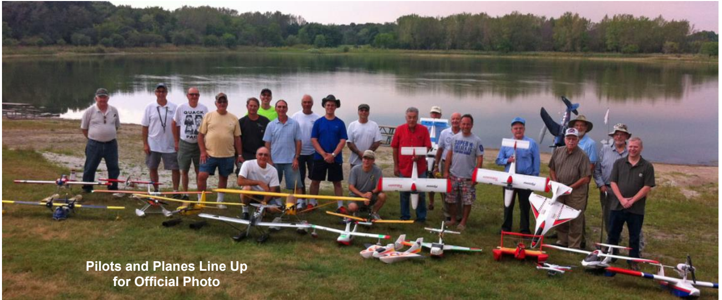
Pilots and Planes Line Up for Official Photo