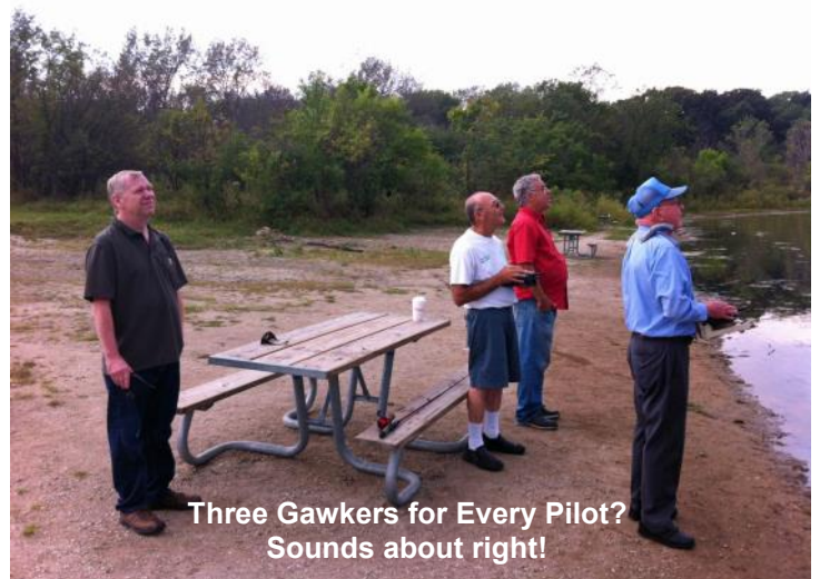
Three Gawkers for Every Pilot? Sounds about right!