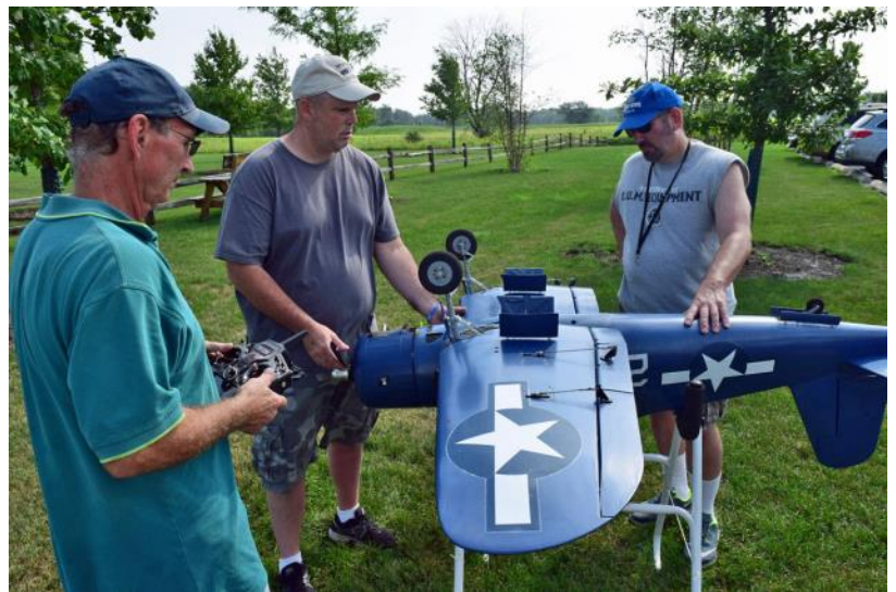
Warbird Day Continued