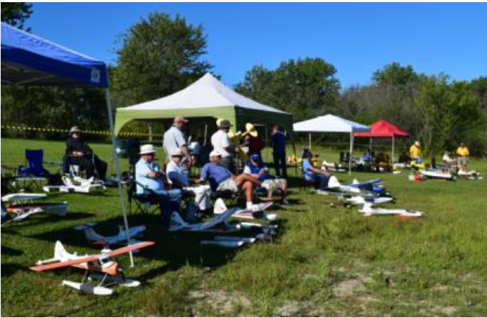
Memorial Day 20 16