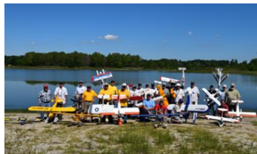
Memorial Day - 2016