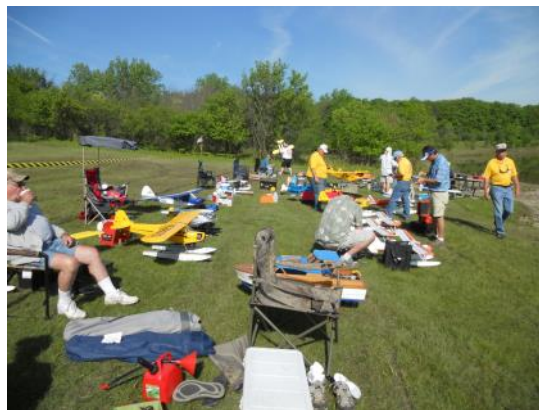
Lots of Flyers; Lots of Planes!

If you haven't been to one of these Float Flys you need to bring the kids and come on out and watch. Better yet, get a float plane and come fly with us!