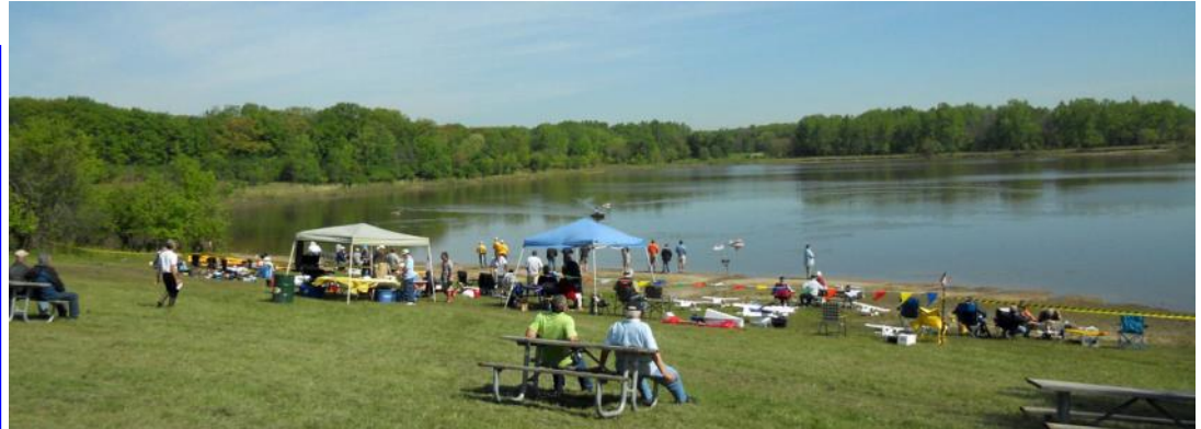
Above: Float Fly Attendees Enjoy Great Weather on May 24